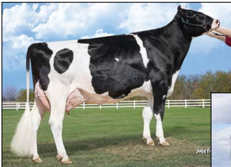
Wildvale Magna P Freska (EX-90 EX-MS) Sells as Lot 13 Maternal Sister to Lot 16