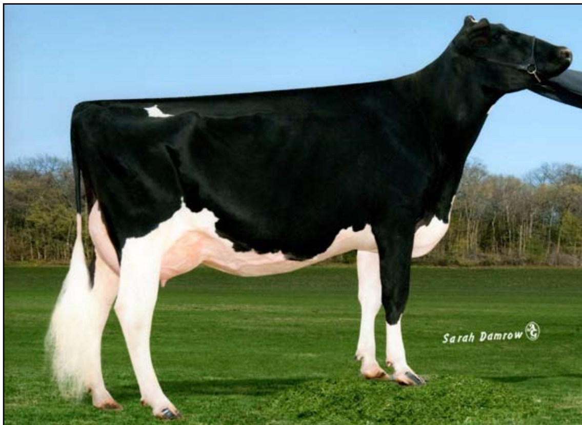
Mil-R-Mor Gold Kara (3E-93 EX-MS) 2nd Dam of Lot 49