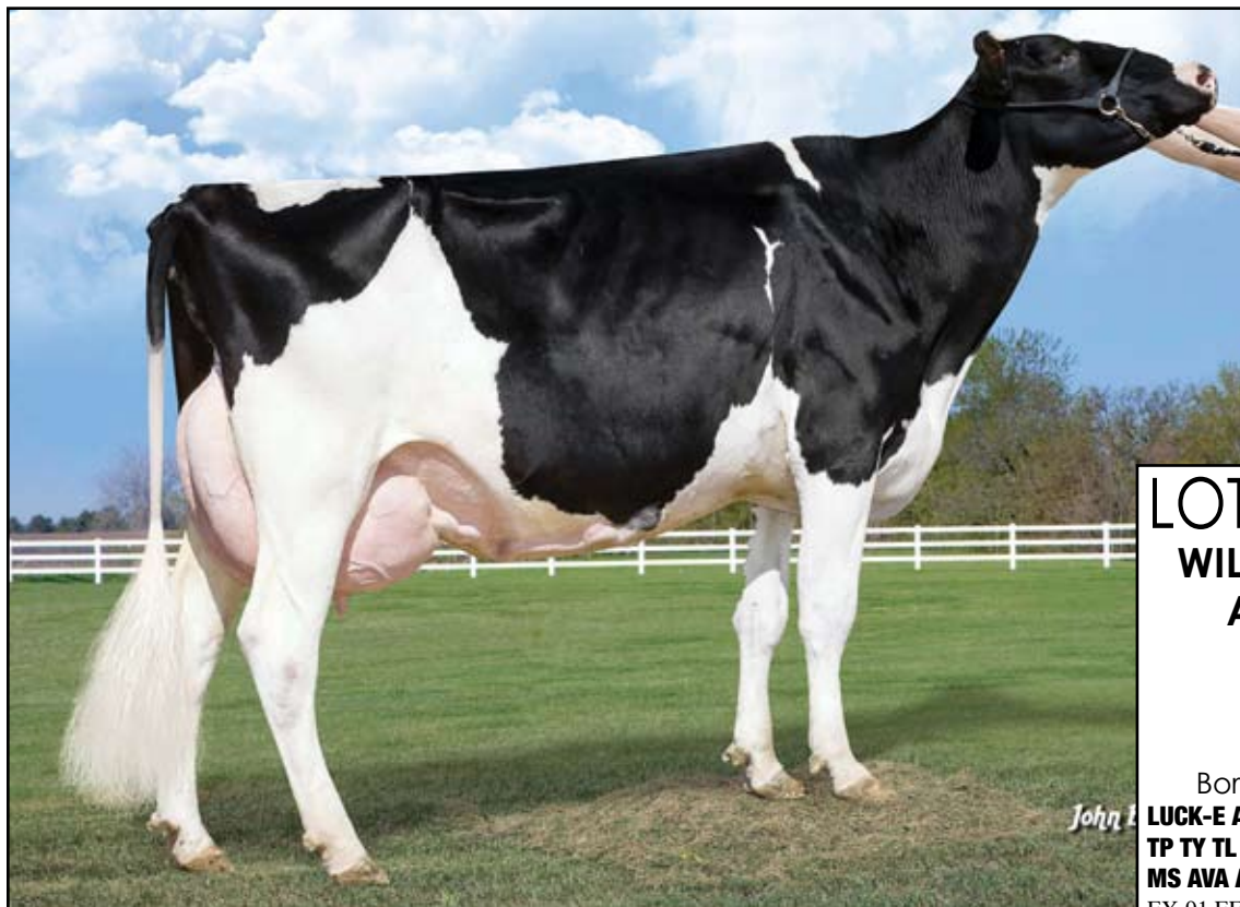
Ms Ava Avila-ET (EX-91 EEEEE) Sells as Lot 8

LOT 8A WILDVALE ADONIS ADVIL-RED-ET 3151932631