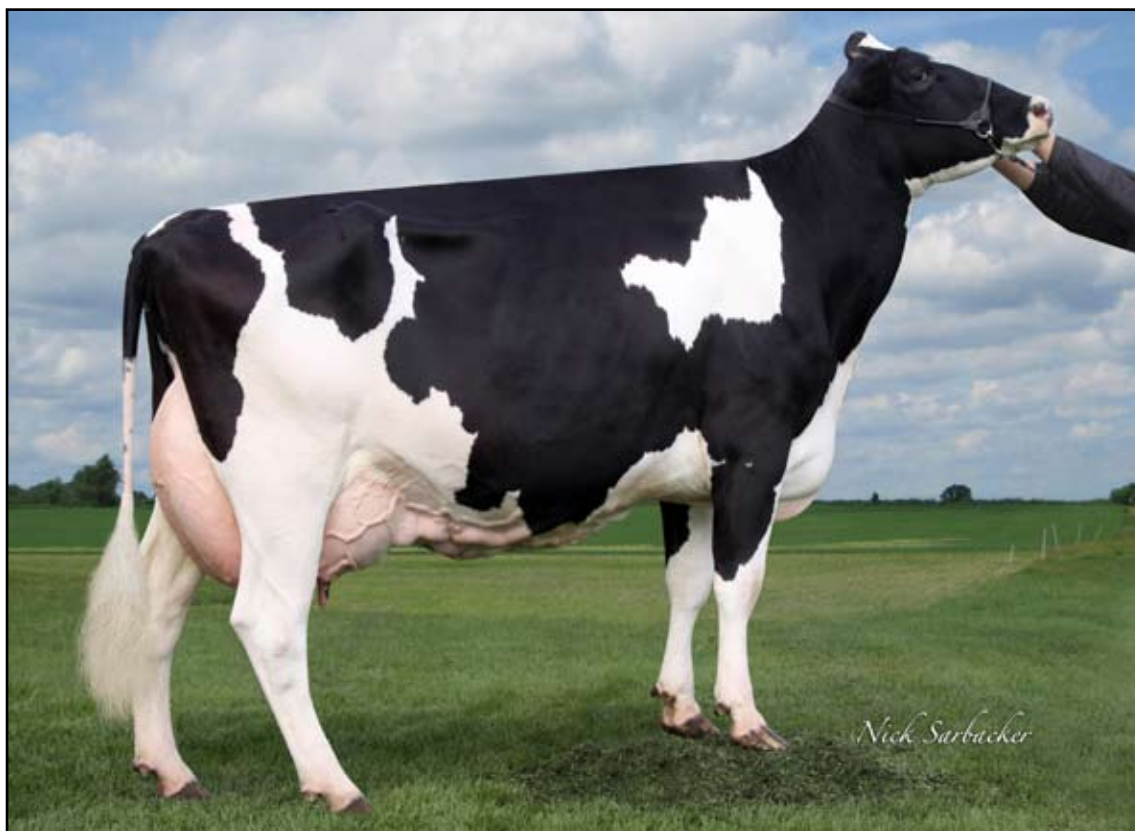
Miss Goldwyn Phantastic (2E-94 EEEEE DOM) Dam of Lot 26