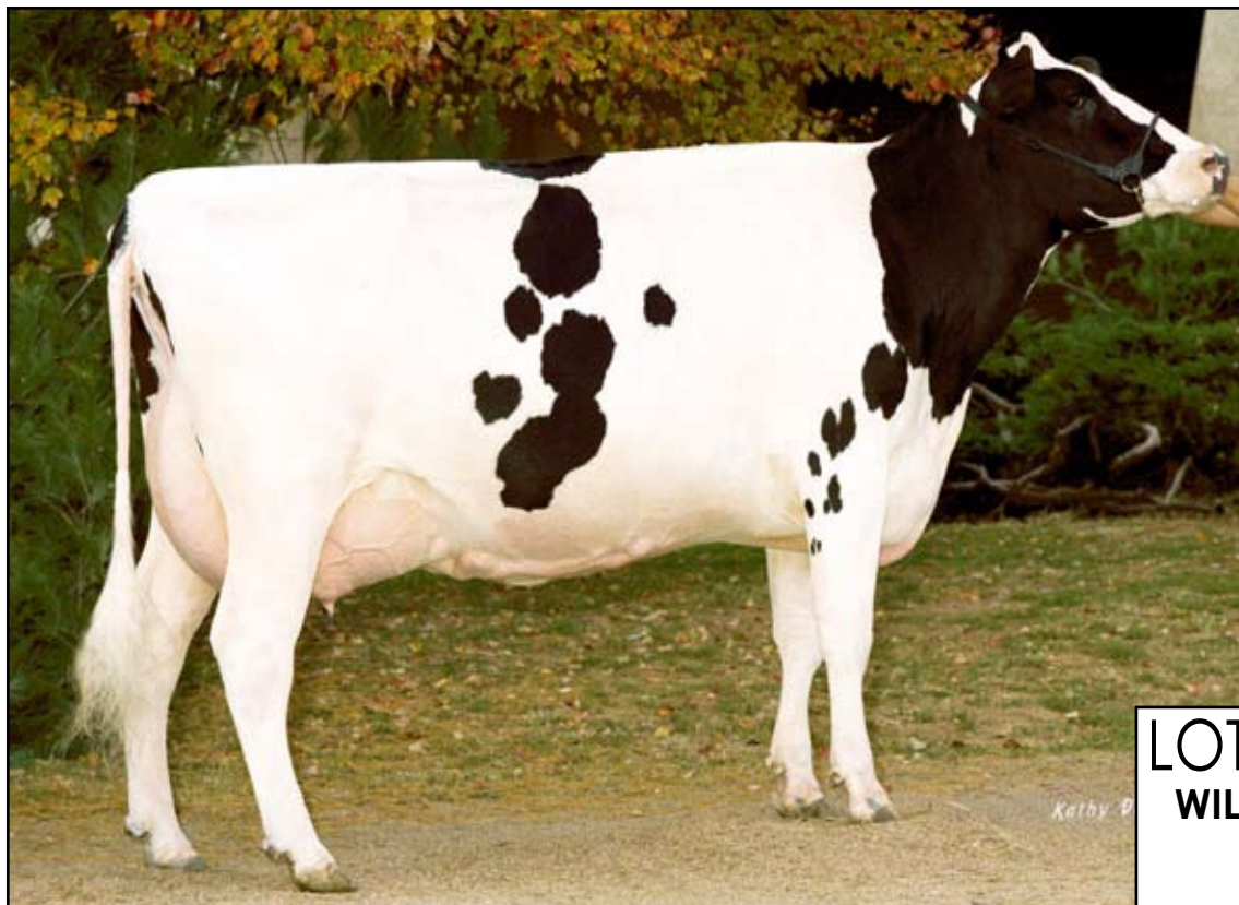
Jo-Clar Jess Patsy (2E-93 DOM) 3rd Dam of Lot 22 & 4th Dam of Lot 23