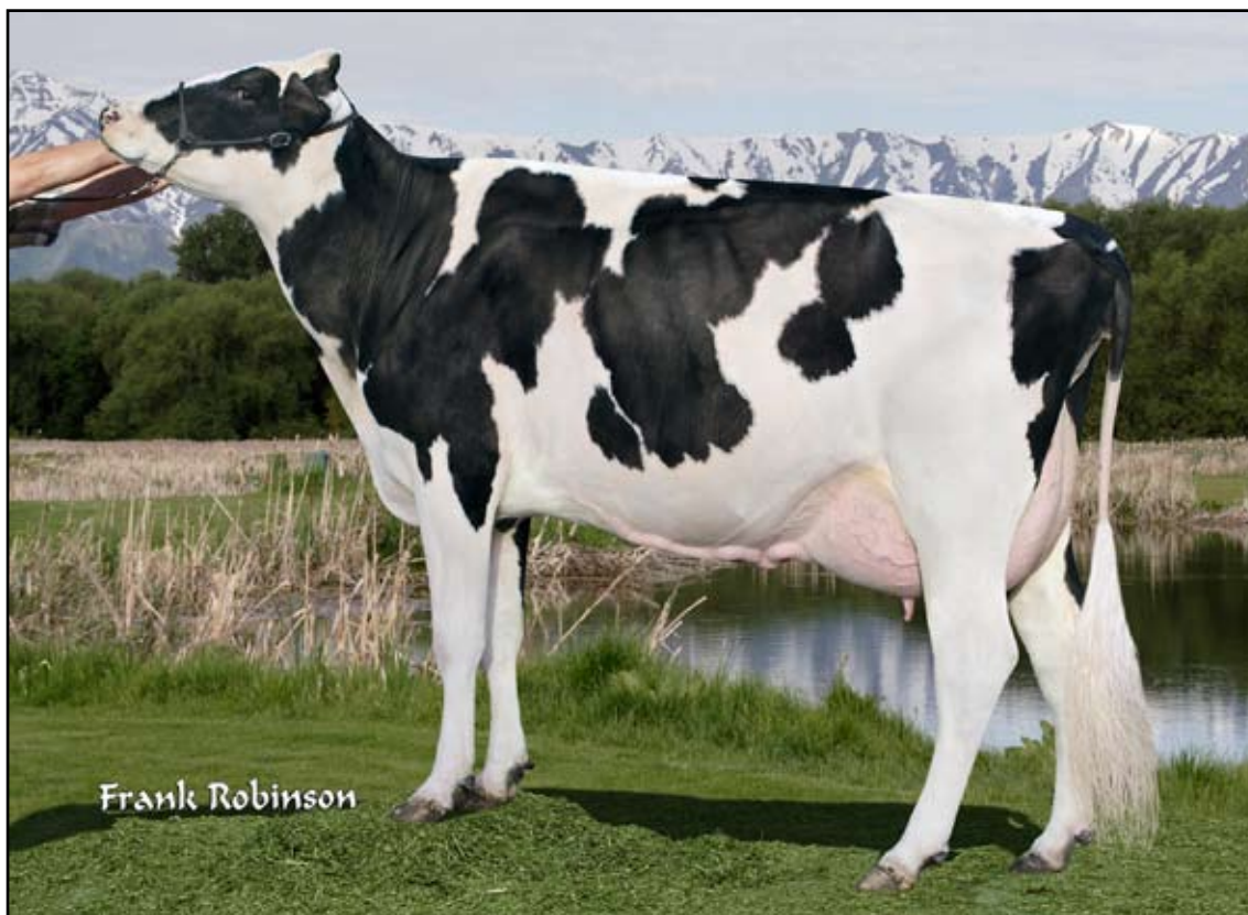
Robin-Hood Cinderella-ET (2E-92 EX-MS) Maternal Sister to 2nd Dam of Lot 37 3-05 2 365 26730 3.5 937 3.0 811