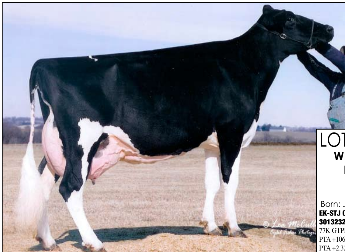
JB-JV Gibson Dainty-ET (2E-93 EX-MS) 3rd Dam of Lot 42 & 4th Dam of Lot 43