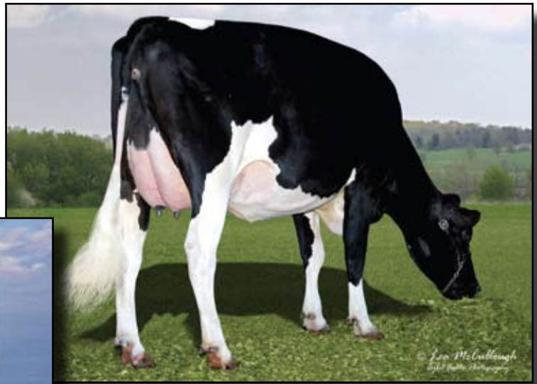
Ernlo Sue-Lynn-ET (VG-88 GMD) 2nd Dam of Lot 20