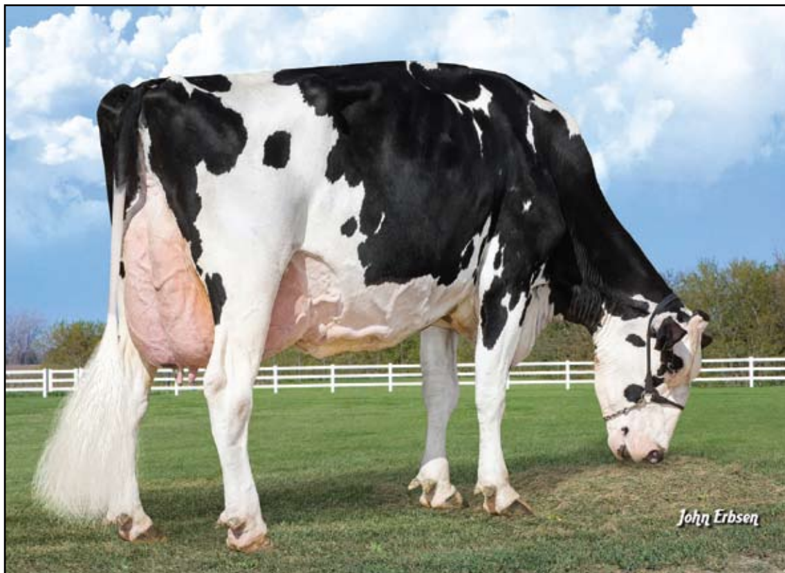
Ms Angelinas Super Ava-ET (2E-93 EEEEE) Sells as Lot 1