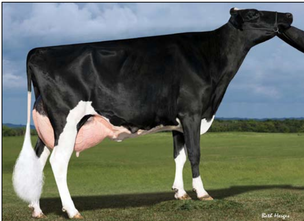
Denlee Alexander Kelsie (2E-92 EX-MS) Dam of Lots 24 & 25