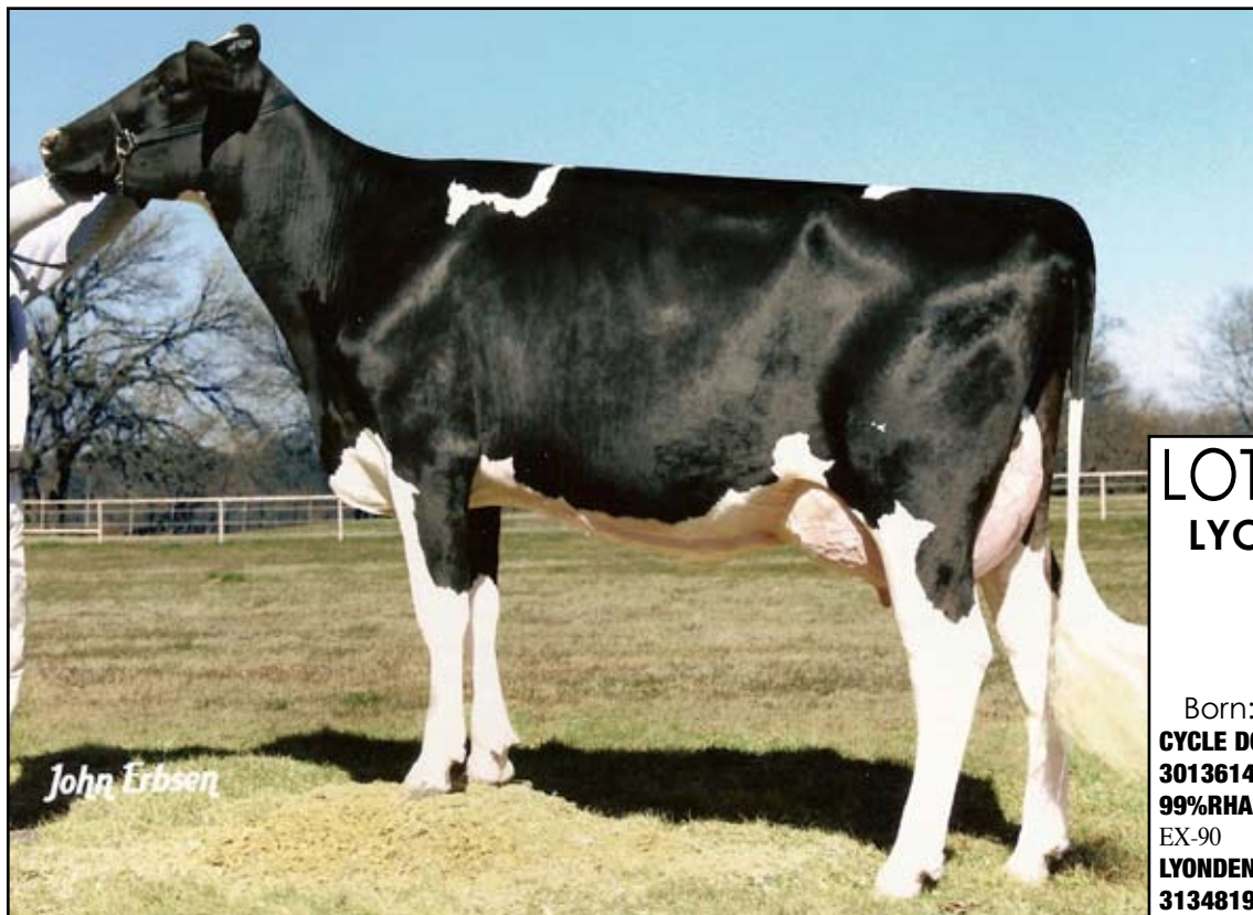
Kerndtway Metro Rylee-ET (2E-91 EX-MS) 3rd Dam of Lot 33 & 4th Dam of Lot 34

LOT 34 LYONDEN JACOBY RINETTI 3134819853