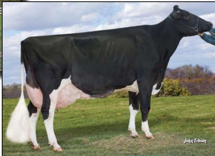
Wildvale Jayz Fraz (2E-93 EEEEE) Dam of Lots 13 & 16, 2nd Dam of Lots 14 & 17