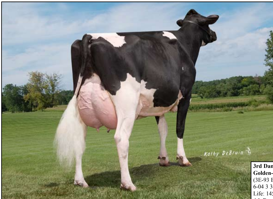
Golden-Oaks Atwd Charla-ET (EX-93 EEEEE GMD) 2nd Dam of Lot 27