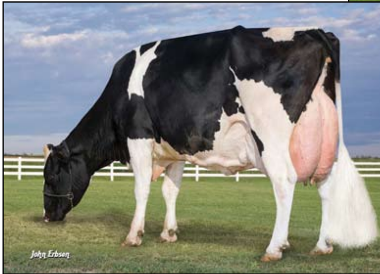
Holbric-ML Iota Doris-ET (2E-90) Sells as lot 20