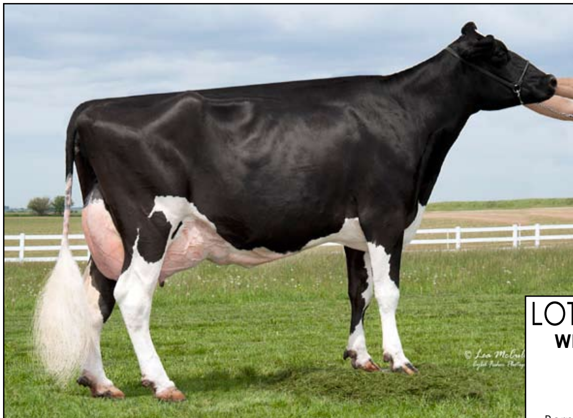
Mil-R-Mor Advent Daisy-ET (3E-92 EX-MS) Dam of Lot 40

LOT 41 WILDVALE CALIF DUSTY-RED 3151932596