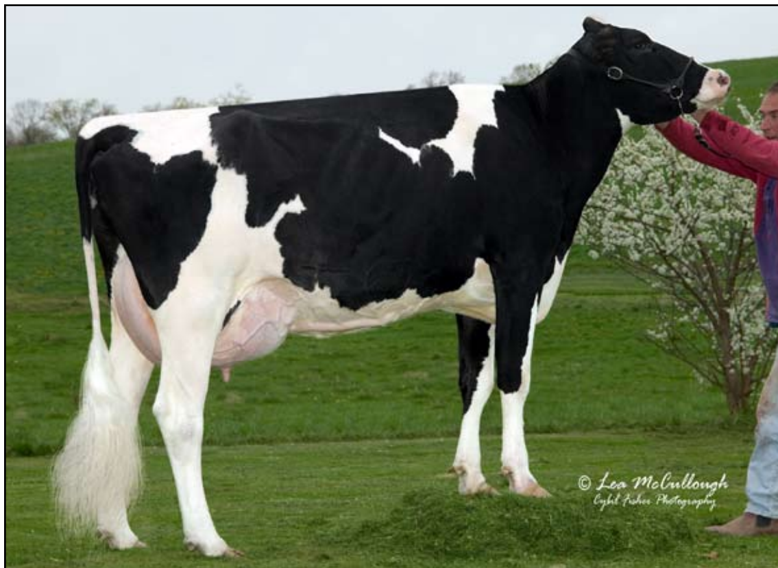
Carpsdale-J Gld Anniversary (2E-91 EX-MS) Dam of Lot 28