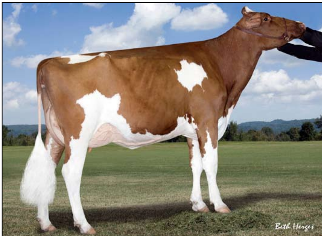
Oakfield-Bro Fontain-Red-ET (2E-90 EX-MS) Dam of Lot 45 & 2nd Dam of Lot 46