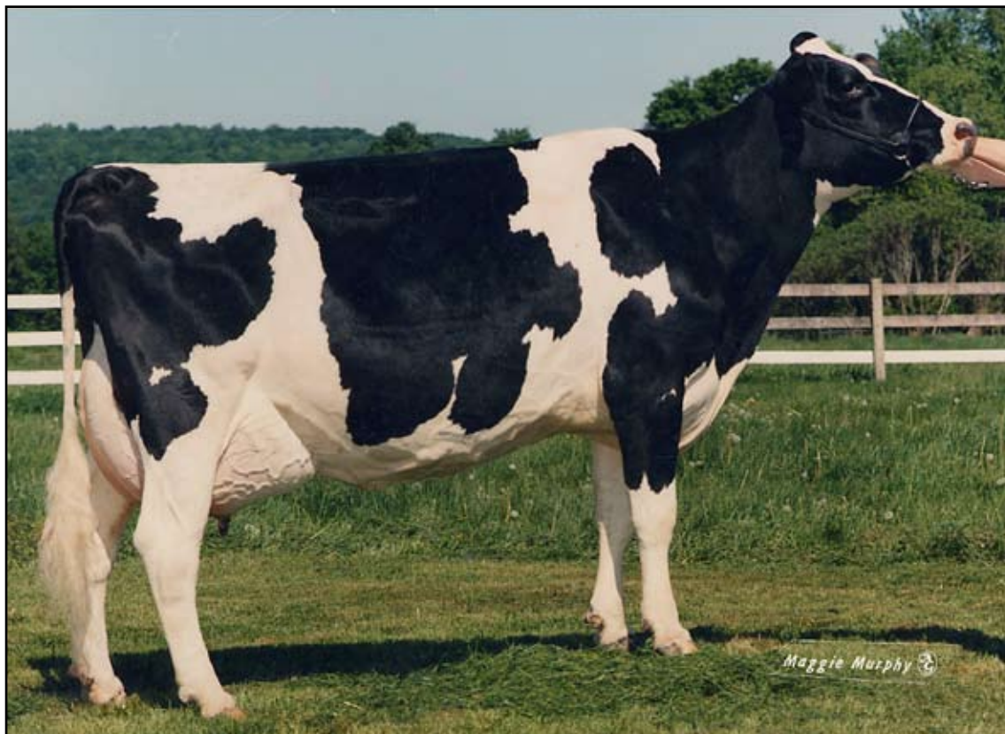
Miklin Mascot Gidget (2E-92 EX-MS GMD DOM) 4th Dam of Lot 98