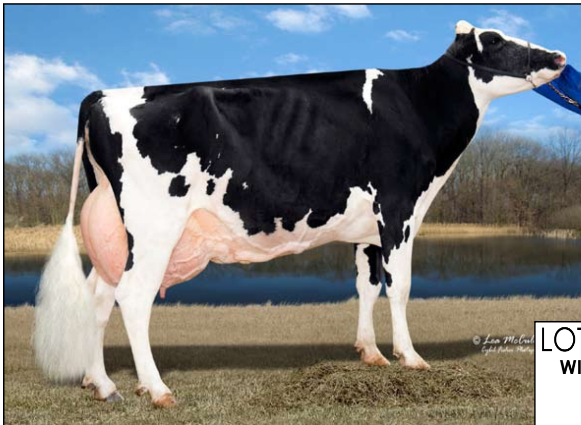
Dream-Prairie Gold Banjo-ET (2E-90 EX-MS) 2nd Dam of Lot 47 & 3rd Dam of lot 48