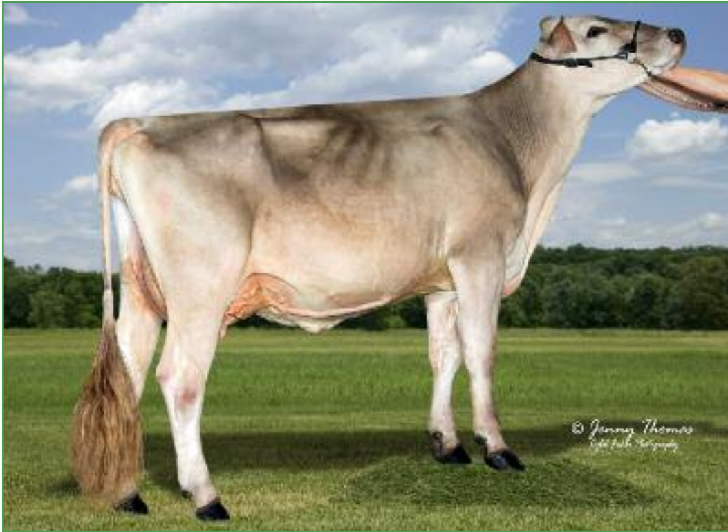
La Rainbow Sweet Silk ETV "VG86" 1-9 365d 26,220m 5.0% 1329f 3.9% 1025p Dam of Lot 24