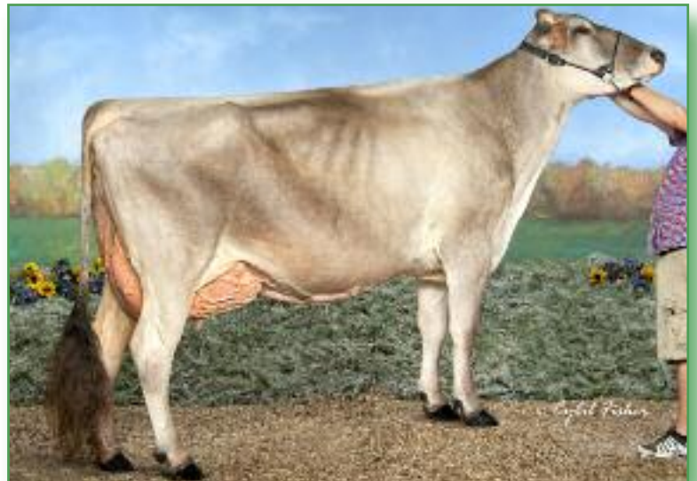
Old Mill HP A Snicklicious ET "E93/93MS" 5-7 364d 27,490m 4.3% 1170f 3.4% 924p Maternal Sister to Dam of Lots 42 and 43