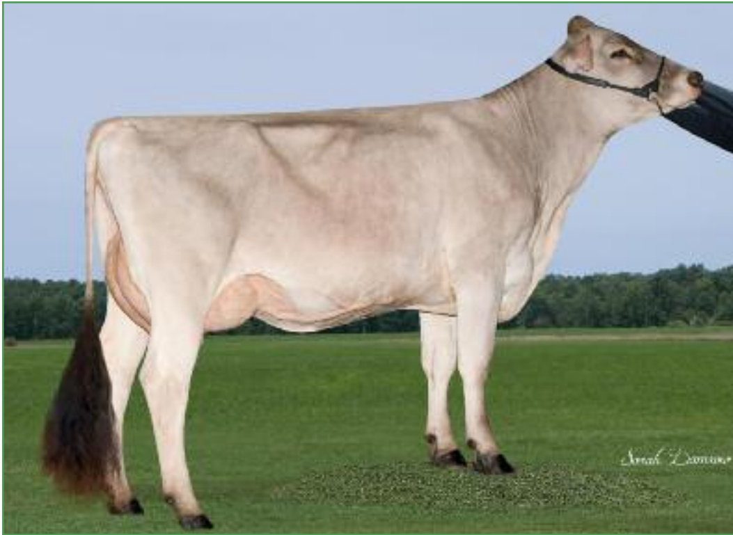
Trout Run Driver Jan P ET "VG86" 2-0 365d 3x 27,340m 5.1% 1389f 3.9% 1059p Dam of Lots 26 and 27