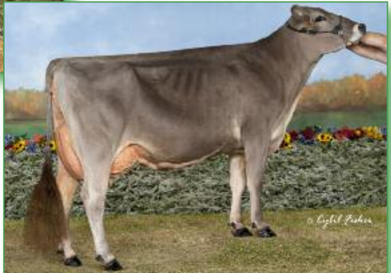
Pit-Crew Wonder Piper "2E92/92MS" 5-5 305d 29,570m 3.9% 1162f 3.3% 966p Nominated All American Jr. 3 Year Old, 2013 Full sister to Dam of Lot 48