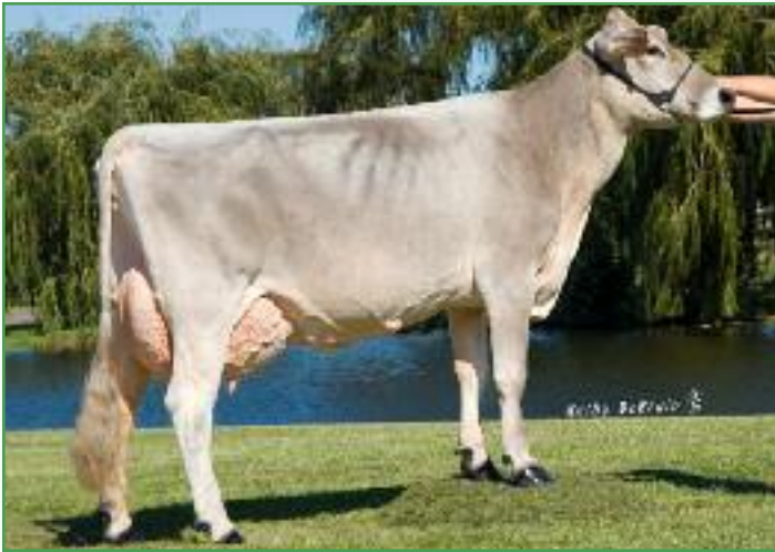
Onword Champ Victoria "3E93/94MS" 8-2 365d 37,500m 3.5% 1318f 3.3% 1249p Lifetime: 3547d 311,080m 11,378f 10,454p Grand Champion, Iowa State Fair, 2007 Maternal Sister to Grandam of Lot 29