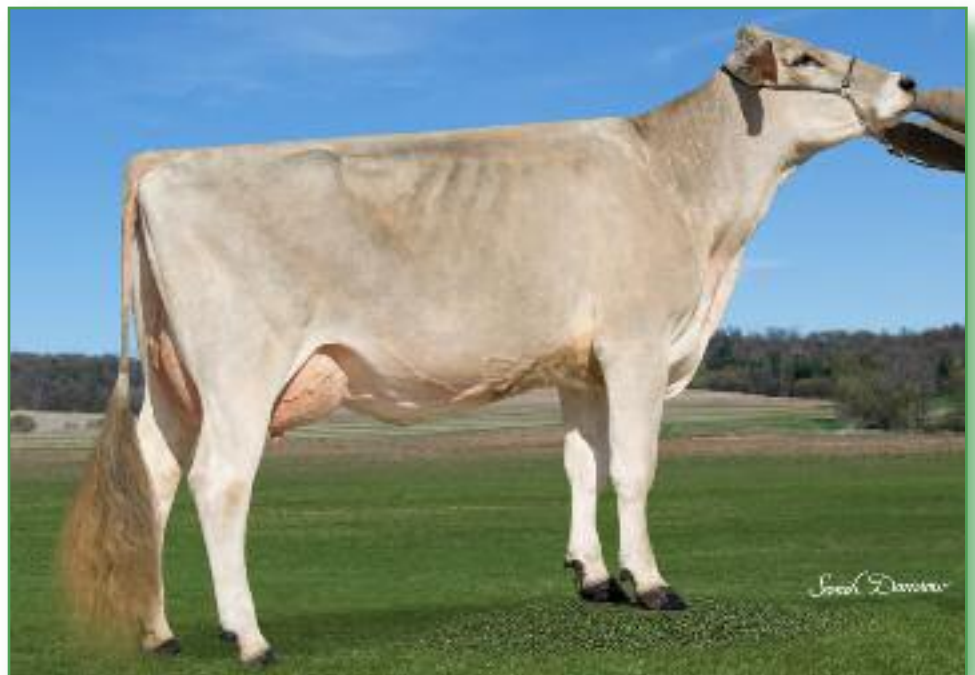
Groves-Sun Jonglr Teacup ET "VG86/86MS" Dam of Lot 21