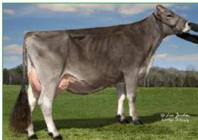
Kruses LJ Jetway Sheba ET "E91/91MS" 3-1 281d 18,140m 4.0% 725f 3.3% 593p Full Sister to Lot 53