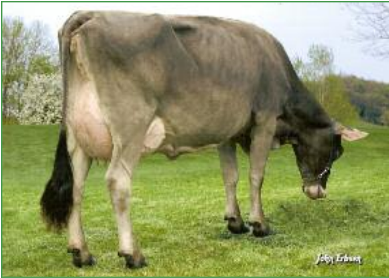
Old Mill TA Snickers ET "2E91/92MS" 3-4 365d 20,748m 4.6% 953f 3.8% 783p Nominated All American Jr. 3 Year Old, 2008 Dam of Lot 42