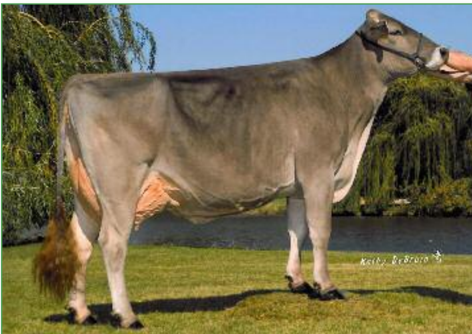
Milk & Honey Tonis Tessa "2E92/92MS" 4-7 365d 22,500m 4.4% 992f 3.1% 697p Reserve All American 4 Year Old, 2011 Grandam of Lots 18 and 19