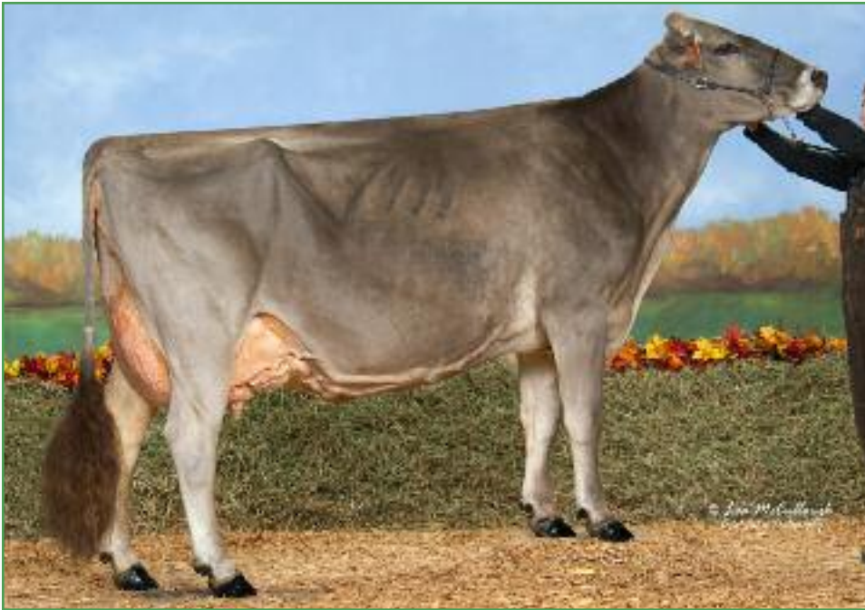
Groves-View Agenda Tina ET "2E94/94MS" 6-8 365d 35,420m 4.6% 1639f 3.5% 1235p Dam of Lot 20; Grandam of Lot 21