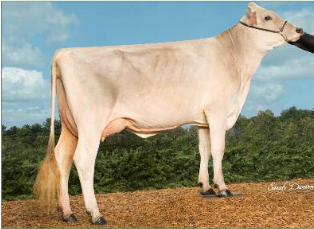
La Rainbow Sweet Vixen ETV 1-10 237d 14,256m 4.6% 648f 3.3% 465p (RIP) Dam of Lot 25