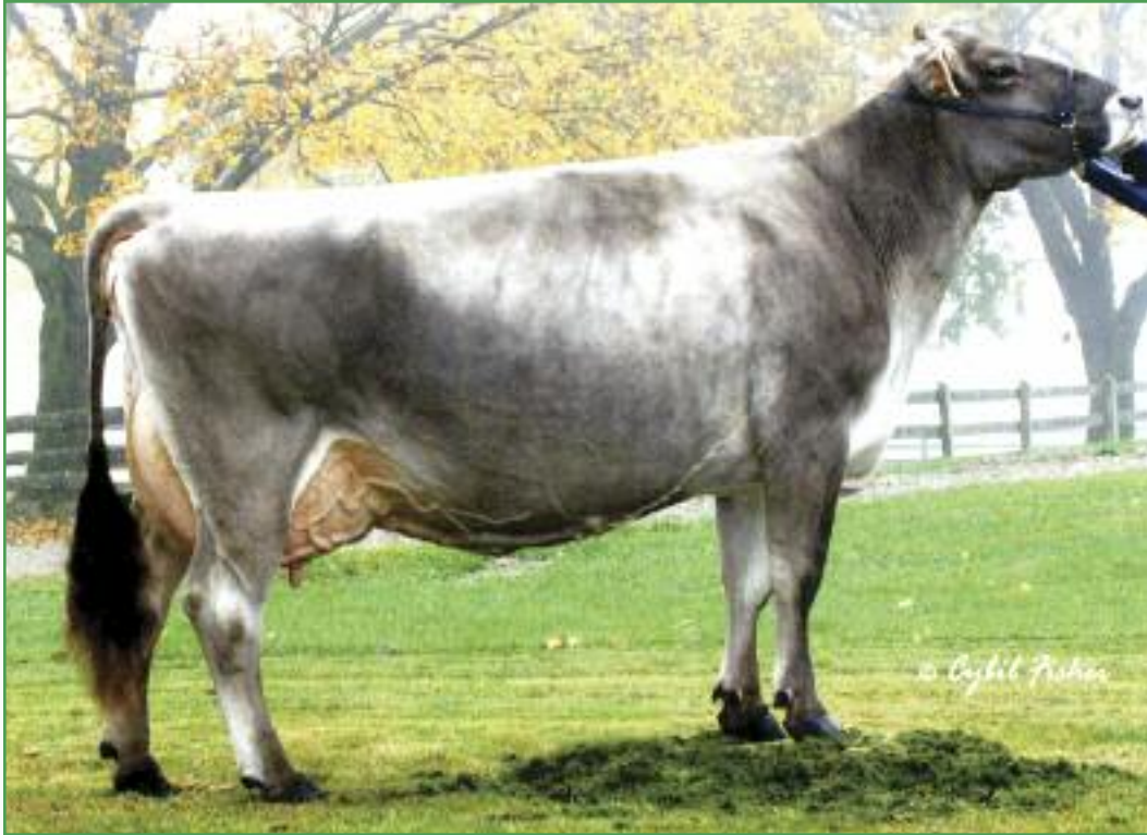
Timberline Jetway Toni "3E94/94MS" 8-11 365d 29,156m 5.3% 1552f 3.5% 1008p All American 1997, 1998, 1999, 2001 3rd Dam of Lot 17, 18, 19 and 20, 4th Dam of Lot 21