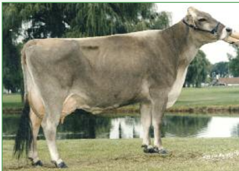
Blessing PR Shirilan "3E93/92MS" 5-0 365d 31,740m 5.7% 1804f 3.5% 1117p National Total Performance Winner, 2000 All American 5 Year Old, 1998 Grandam of Lots 10 and 11