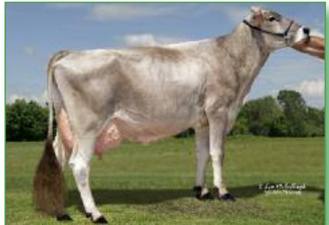
Kruses LJ Victor Starstruck "2E90/90MS" 5-0 365d 28,750m 4.0% 1154f 3.4% 965p Maternal sister to Dam of Lot 53