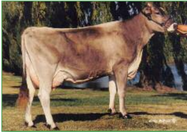
Kruses Ensign Sylvia "3E92/92MS" 4-1 354d 23,060m 4.2% 960f 3.8% 865p Grandam of Lot 53