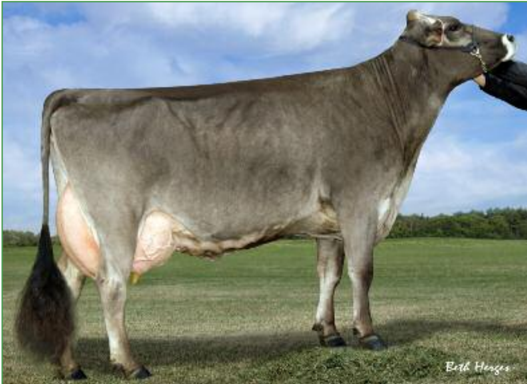
Four-M Fastbreak Jamica ET "2E90/90MS" 3-5 355d 3x 33,580m 3.9% 1303f 3.5% 1185p Dam of Lot 35