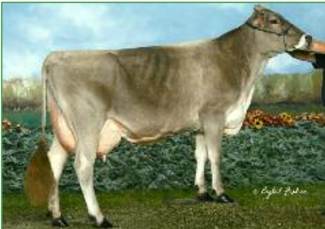
Kruses LJ Victor Starla "3E91/91MS" 7-1 365d 31,768m 4.4% 1387f 3.3% 1025p Maternal sister to Dam of Lot 53