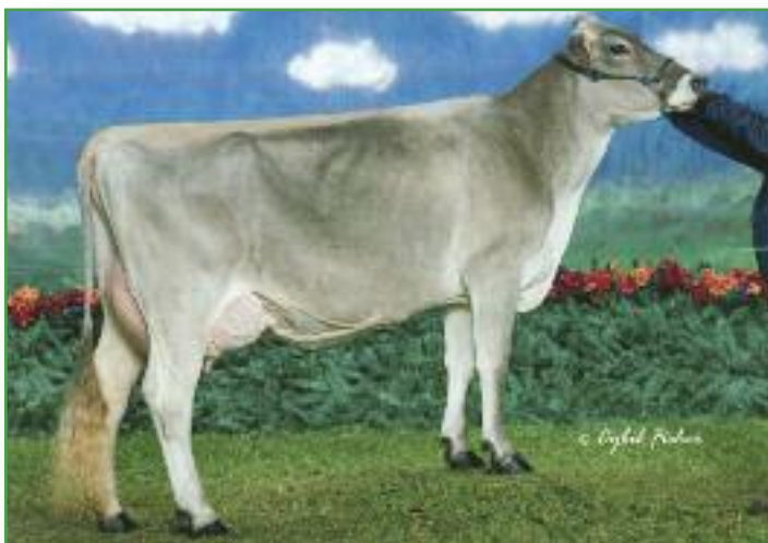
Top Acres Pilot Gusto ET "E90/90MS"

Reserve Grand Champion Northeast National Jr. Show, 2015 Dam of Lot 39