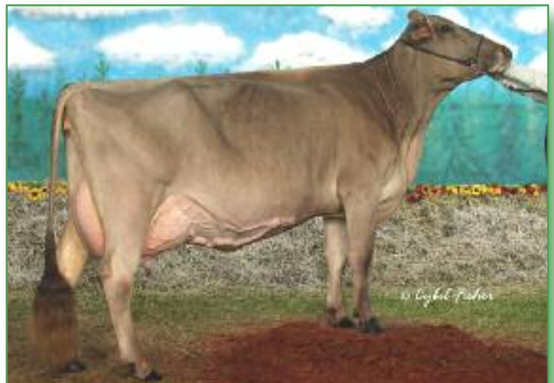
Brook Run Jetway Fern "E93/93MS" 4-5 365d 23,100m 4.2% 959f 3.6% 841p All American 2000, 2001 3rd Dam of Lot 41; 4th Dam of Lot 40