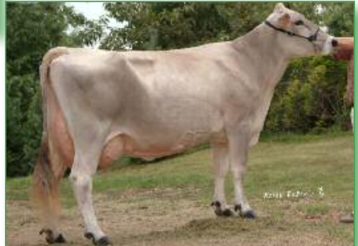
Onword Starbuck Violin ET "3E91/91MS" 7-10 365d 38,430m 3.9% 1489f 3.3% 1265p 1st Aged Cow, Iowa State Fair, 2008 3rd Dam of Lot 29