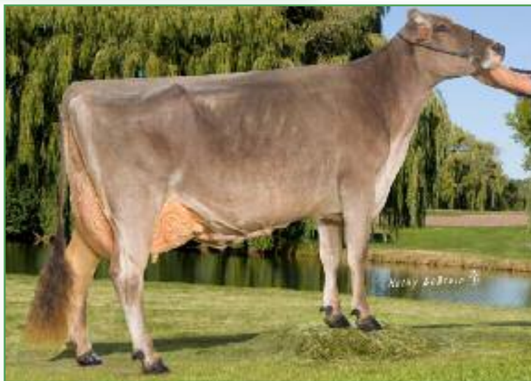
Old Mill E Snickerdoodle OCS "5E94/97MS" 6-9 365d 33,590m 4.2% 1418f 3.6% 1193p All American, 2001, 2002, 2003, 2004, 2005, 2006, 2008, 2009 Supreme Champion, World Dairy Expo, 2003 Grandam of Lots 42 and 43