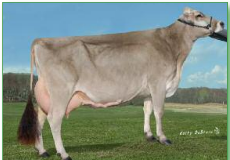
Kulp Hillpoint Sheryl ET "E90" 6-2 305d 22,760m 4.0% 909f 3.4% 782p Dam of Lot 11