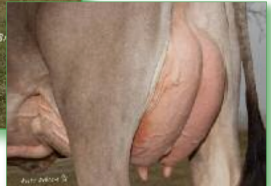
Twinkle-Hill Cadence Oakley "VG88" 1-11 365d 24,100m 4.1% 979f 3.3% 784p 1st Sr. 2 Year Old, Eastern States Expo, 2016 Dam of Lot 12