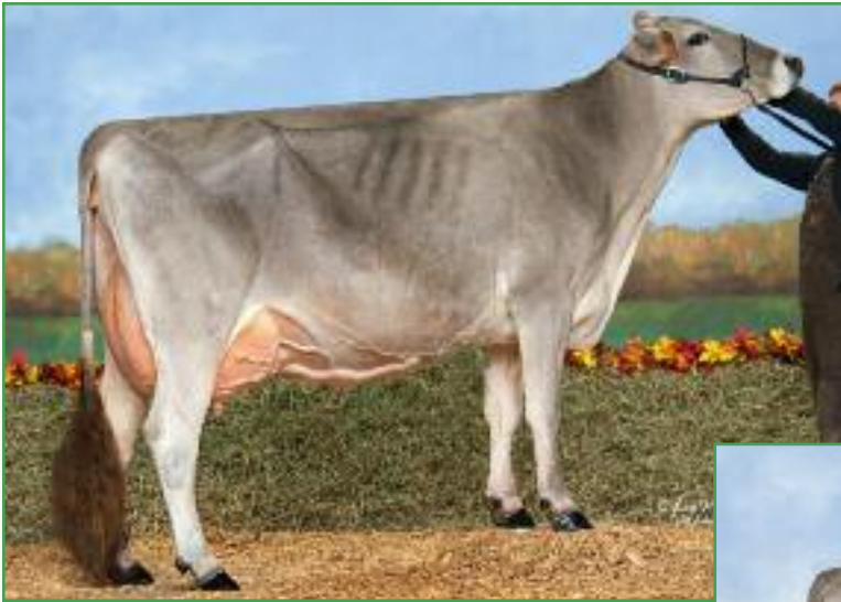
Pit-Crew Wonder Pizazz ET "2E93/93MS" 4-9 345d 23,810m 4.2% 993f 3.3% 786p Nominated All American Jr. 2 Year Old, 2012 Dam of Lot 48