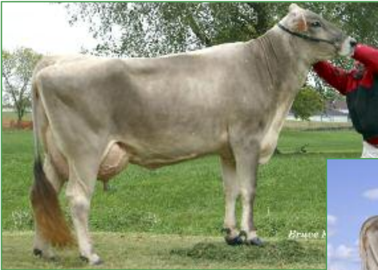
V B River Pluma Madora "2E92/91MS"

6-7 365d 40,490m 4.2% 1692f 3.2% 1307p National Total Performance Winner, 2012 Grandam of Lot 14