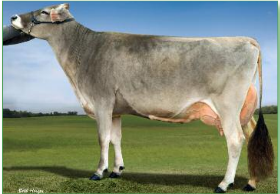
Groves-Sun Wdrmnt Twiggy "E91/91MS" 3-5 365d 30,100m 4.4% 1339f 3.4% 1014p Dam of Lots 18 and 19