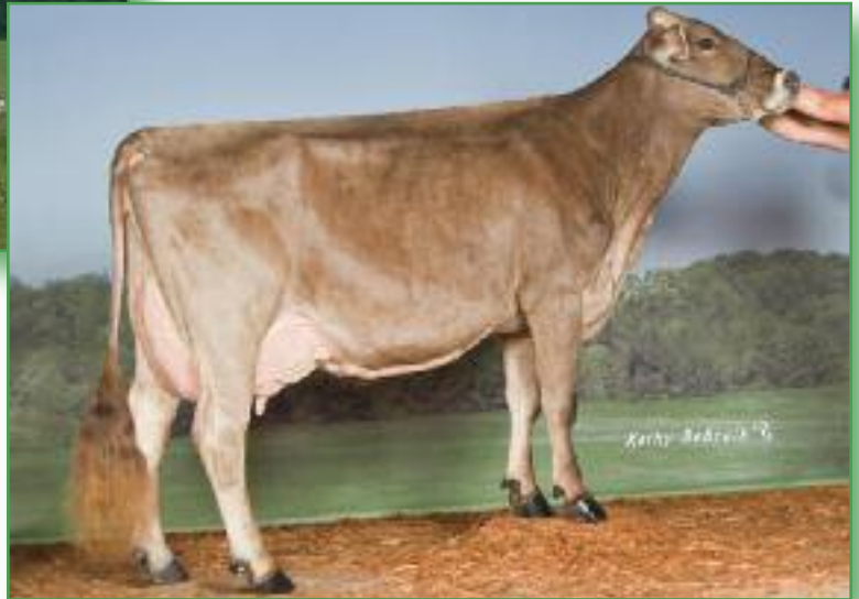
V B Hillpoint Marilyn ET "2E92/91MS"

1-11 298d 19,180m 4.3% 817f 3.5% 673p 1st Jr. 3 Year Old and Intermediate Champion Midwest Spring Show, 2018 Dam of Lot 14