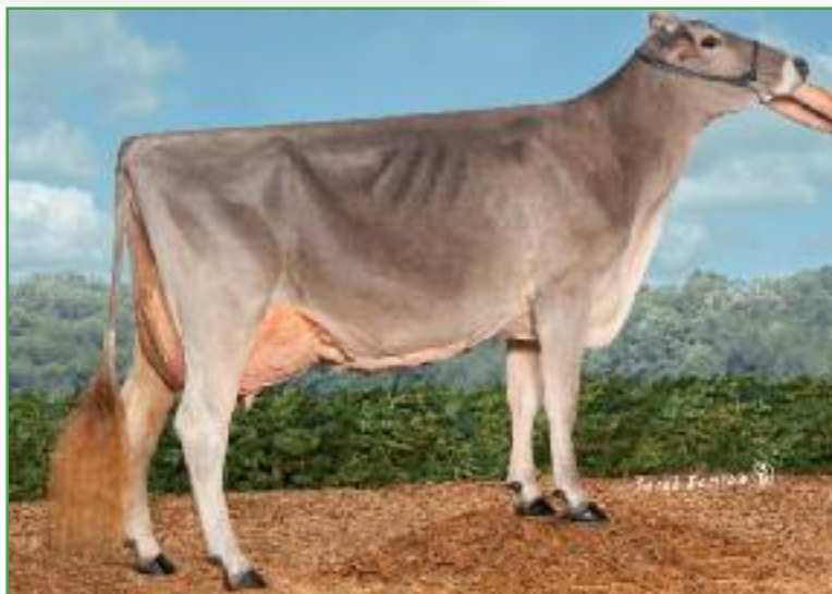
Random Luck Vision Perri ET "Ex90/90MS" 3-6 365d 29,620m 4.5% 1331f 3.2% 946p Supreme Champion, Wisconsin State Fair, 2013 Sister to Dam of Lots 30 and 31