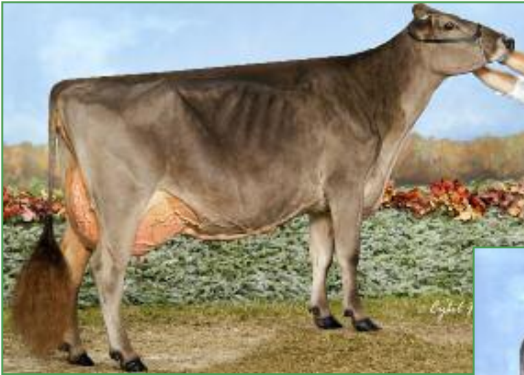
Kar-Linn Wonderment Reese ET "2E93/93MS" 5-9 305d 26,020m 5.2% 1365f 3.0% 788p All American Aged Cow, 2017 Dam of Lot 16