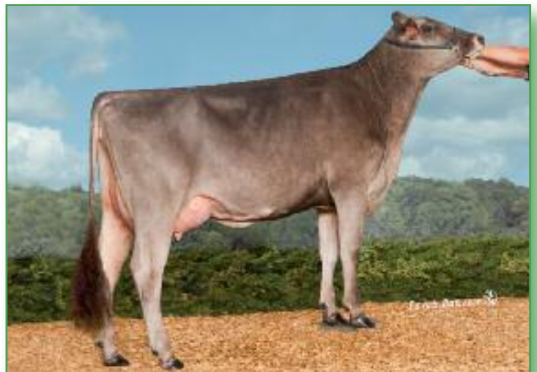
Riedland Faust Pastel "VG88" 2/11 327d 19,358m 3.8% 746f 3.5% 679p Reserve All American Yearling in Milk, 2015 Dam of Lot 32