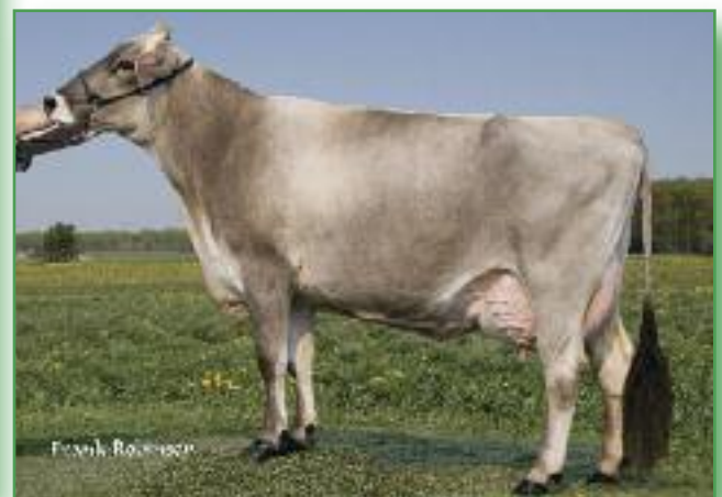
Top Acres Garbro Wanda ET "E91/92MS" 4-0 305d 23,790m 4.7% 1109f 3.6% 864p Hon. Mention All American 4 Year Old, 2014 Dam of Lot 9, 9A and 9B