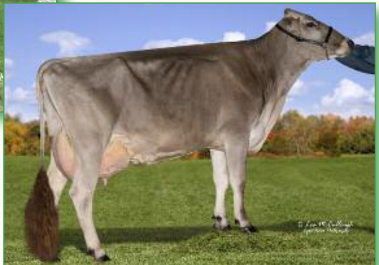
V B Hillpoint Won Million ET "2E90"

5-11 365d 35,610m 3.1% 1105f 3.3% 1182p 3rd Dam of Lot 15