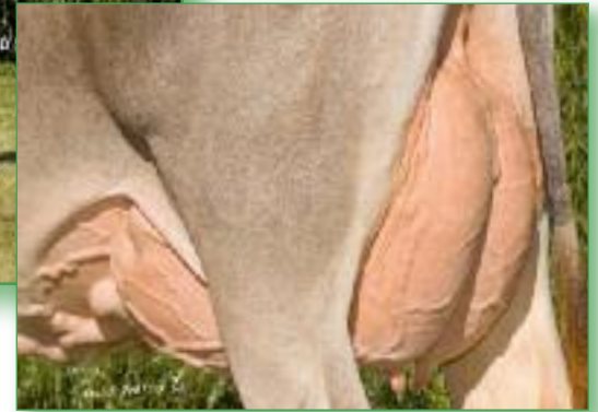
Sun-Made GB Plt Pretzel ET "3E93/94MS" 2-3 365d 32,770m 4.4% 1453f 3.5% 1135p Dam of Lot 13