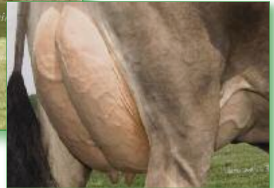
Alpine Hills Star Venus ET "2E94/93MS" 5-10 365d 34,740m 5.1% 1787f 3.4% 1172p Reserve All American 4 Year Old, 2007 Dam of Lot 51