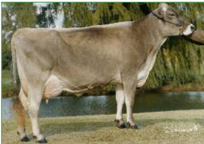
Bo Joy Ensign Gredel "5E94/94MS"

4-11 365d 30,190m 4.6% 1384f 3.4% 1039p Reserve All American, 1997, 1998, 1999 Grandam of Lot 38, 3rd Dam of Lot 39