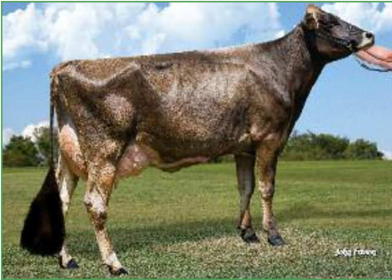
Cutting Edge T Flurry "VG88/ExMS" 3-4 354d 21,670m 3.3% 720f 3.2% 694p Dam of Lot 40