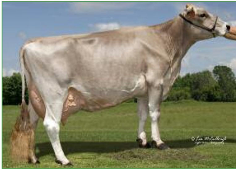
Riedland Flower Florence ET "2E90/90MS" 3-3 365d 22,550m 4.4% 998f 4.5% 778p 3rd Dam of Lot 4