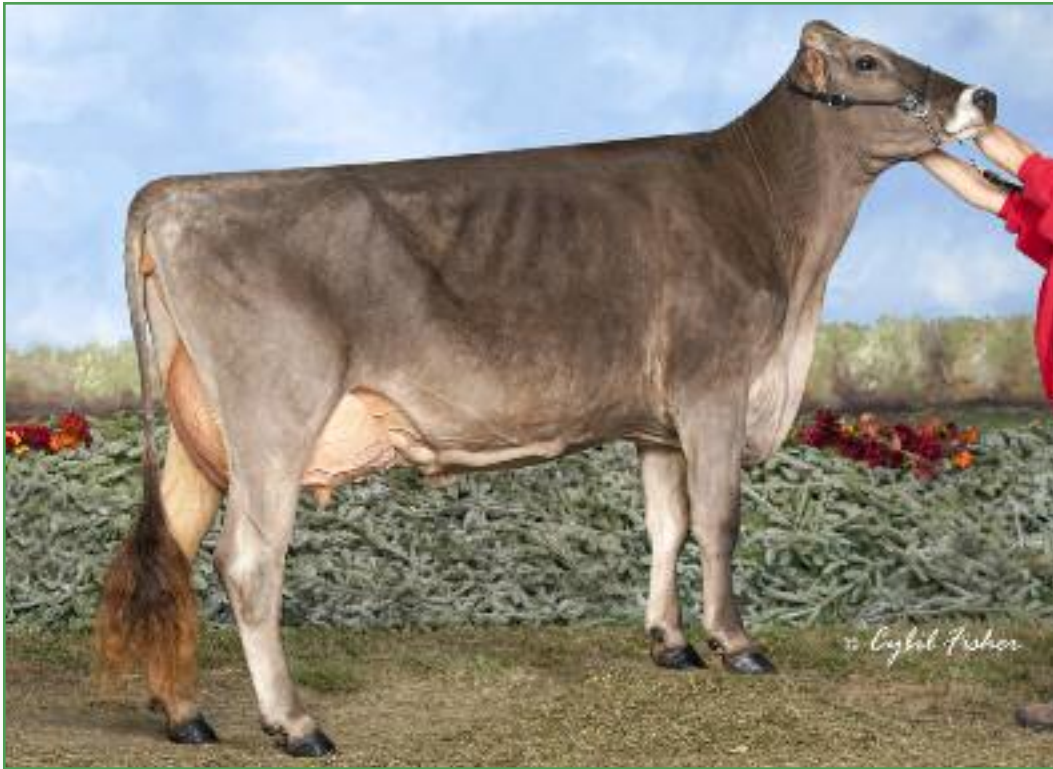
Fjel-Mar Legacy Foxy ET "2E90" 4-5 365d 25,990m 4.2% 1096f 3.8% 1000p Nominated All American Jr. 3 Year Old, 2012 Grandam of Lot 3, 3rd Dam of Lot 2