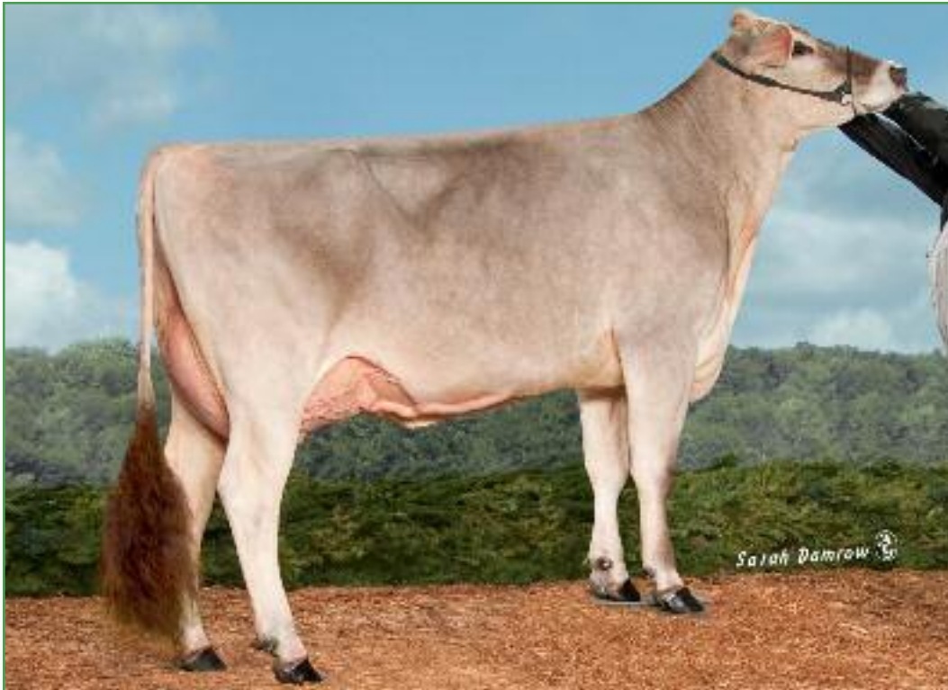
R Hart Explorer 905 "E90/90MS" 4-0 348d 21,480m 4.9% 1050f 3.8% 810p All American, 2013 Dam of Lot 47