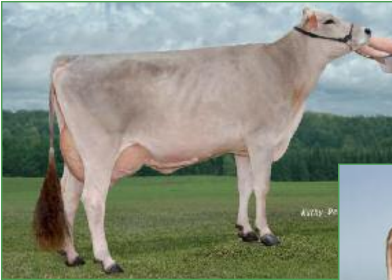
V B HP Hillpoint Jongleur Merit ET "E90/91MS"

1-11 298d 19,180m 4.3% 817f 3.5% 673p 1st Jr. 3 Year Old and Intermediate Champion Midwest Spring Show, 2018 Dam of Lot 14