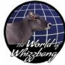
Top Acres Supreme Wizard ET "2E95/94MS" 7-5 363d 35,226m 4.9 1730f 3.5 1240p (RIP) All American, 2013, 2017 Grand Champion, International Show, 2017 Dam of Lot 8