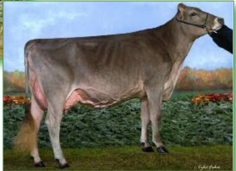
Kar-Linn Supreme Reagan "E91/92MS" 4-4 365d 20,476m 4.1% 844f 3.5% 722p All American Fall Yearling, 2009 Grandam of Lot 16