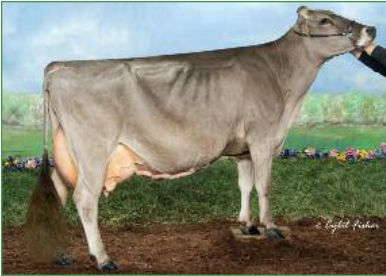
Kulp-Terra TA Showgirl ET "2E93/92MS" 6-11 365d 35,800m 4.1% 1456f 3.6% 1272p Nominated All American, 2008, 2011 Dam of Lot 10