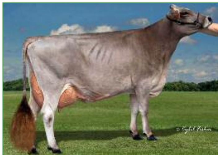
Cutting Edge B Galaxy ET "E90/90MS"

4-8 365d 3x 27,820m 3.9% 1098f 3.3% 914p Dam of Lot 38