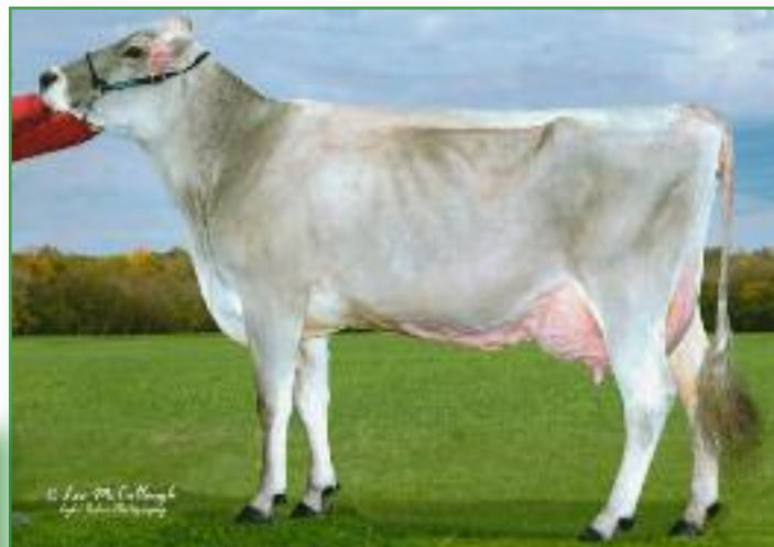
Top Acres Pilot Gritz ET "2E91/90MS"

4-11 365d 30,190m 4.6% 1384f 3.4% 1039p Reserve All American, 1997, 1998, 1999 Grandam of Lot 38, 3rd Dam of Lot 39