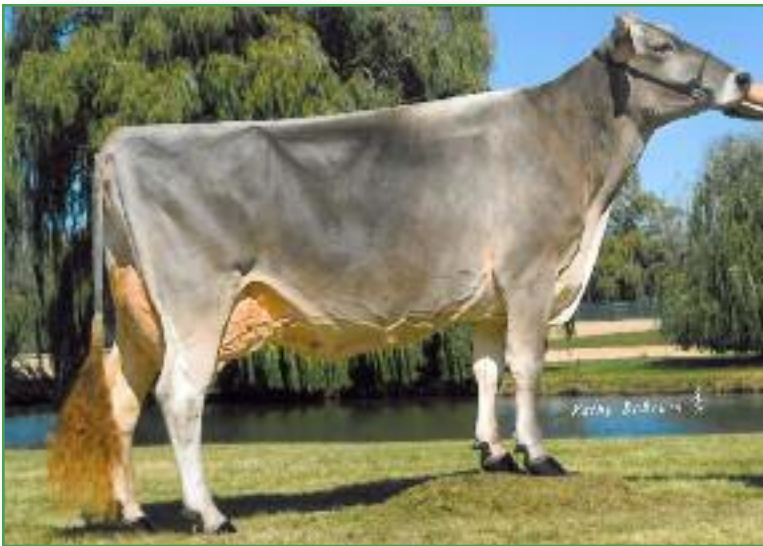
Random Luck KB Phoebe "2E93/94MS" 5-8 365d 34,210m 4.5% 1541f 3.1% 1048p Hon. Mention All American Sr. 3 Year Old, 2006 Grandam of Lots 30 and 31 3rd Dam of Lot 32