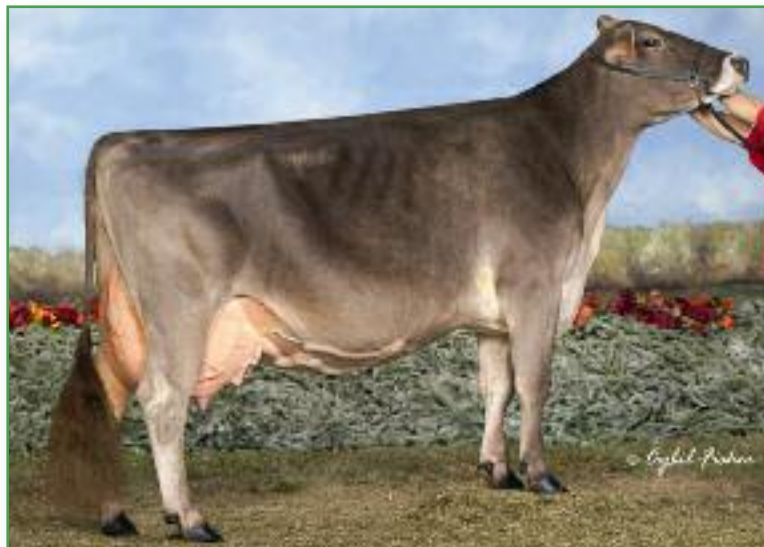
Round Hill Legacy Flyhi ET "3E93/93MS" 6-5 365d 29,750m 4.4% 1304f 3.4% 1021p Nominated All American, 2009, 2012 Grandam of Lot 41; 3rd Dam of Lot 40